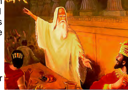
The wild party is interrupted by a startling message delivered in an even more startling way

"But you his son, Belshazzar, have not your heart, a l though you knew all this." (Verse 22)