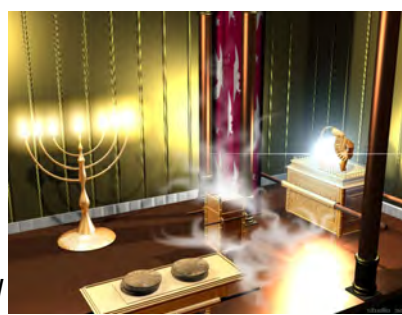
Belshazzar took the gold and silver vessels captured from the Jewish temple to drink wine from

So deceived was Belshazzar by the old myth of "Babylon the Eternal" and so blind to the Persian military threat, that at the most dangerous time possible, he invited thousands of his lords and ladies