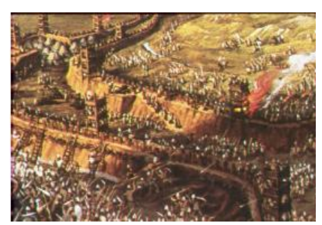
The Destruction of Jerusalem.

The martyrdom of Stephen. A far deeper significance is attached to the stoning of Stephen than may appear to the casual reader. It clinches the former rejection of the Gospel by responsible Jewish leaders at Jerusalem (Acts 7:51-54). It precipitates a new era in Gospel expansion. Exclusive labour for Jews abruptly ceases. Christian witnesses, scattered by the sudden outburst of savage persecution, are impelled to evangelise the Gentiles. Samaritans and the Ethiopian eunuch are the first-fruits from among non-Jews (Acts 8:1,4,5,27,29).