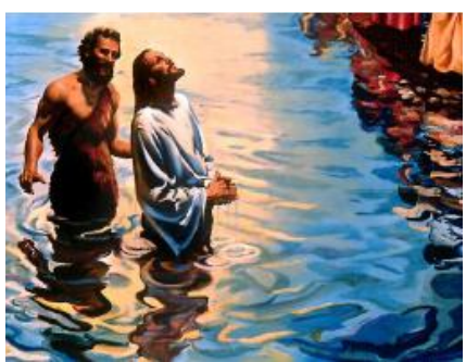
The Baptism of Jesus begins the 70<sup>th</sup> week.

The 7 weeks and 62 weeks equal 483 prophetic days or 483 years. This means, counting ahead 483 years from 457 B.C. we are brought to the time of the Messiah, i.e. Jesus Christ. The date comes to 27 A.D.