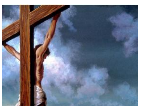
Jesus cut off in the midst of the 70th week.

AND AFTER THE SIXTY-TWO WEEKS MESSIAH SHALL BE CUT OFF, but not for Himself; and the people of the prince who is to come shall destroy the city and the sanctuary. The end of it shall be with a flood, and till